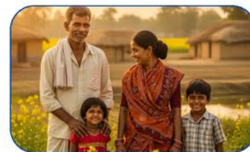
*AI-Generated Representational Image

We are building an ecosystem of partners at all levels to create lasting change for the children and families we serve. We will continue to activate child protection units, forge strategic partnerships with civil society organizations, and transform Child Care Institutions into centers of excellence.