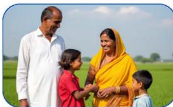
*AI-Generated Representational Image

Collaboration with governments is the key to enacting real change to ensure positive outcomes for the children we serve. We will work together to make sure that child separation is only used as a last resort, reunite families, and strengthen the families of children.