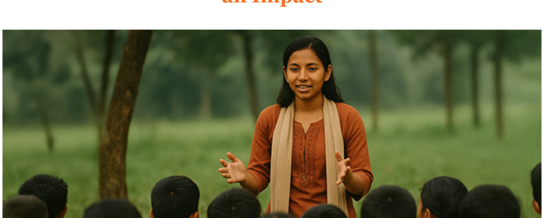
*AI-Generated Representational Image