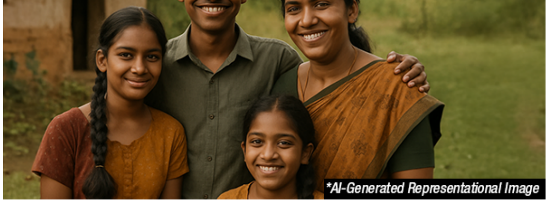
*AI-Generated Representational Image