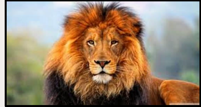
Mr. Rangan, Father/In-charge

One day I needed to take Darsha, the elephant, to the doctor. Jiya and the other young giraffes were doing their school work quietly. I told the lion, Mr. Rangan, who was the father/In-Charge that I needed to leave. He said his friend, Mr. Gupta the zebra could help the young giraffes with their school work while I was gone. Mr. Gupta had helped the giraffes before, and often came to meals and special occasions. I told Mr. Rangan, the father/In-charge, I would be gone only an hour.